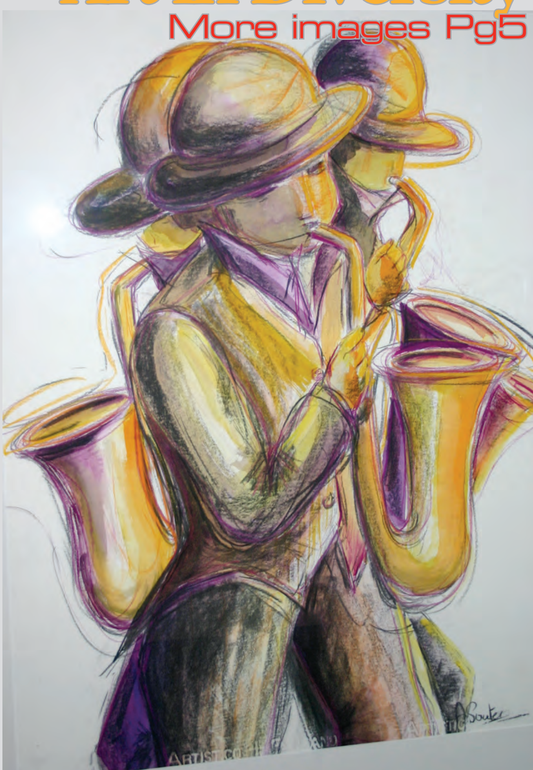
Into The Mystic by Angela Souter