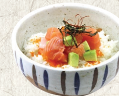
Salmon Avocado Don*