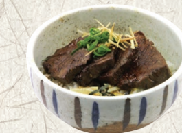
Wagyu Beef Teriyaki Don*