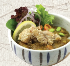
Japanese Curry Don*

Wagyu Beef Teriyaki Don Reg 18.80 / Sml 13.30 Grilled beef, spinach and egg omelette on rice