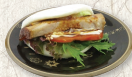
Pork Steamed Bun Burger