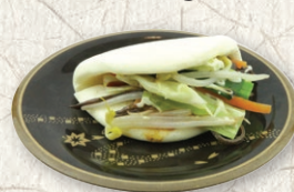
Vegetable Steamed Bun Burger