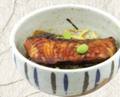
Salmon Teriyaki Don*