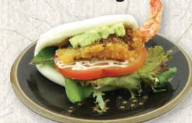
Prawn Steamed Bun Burger