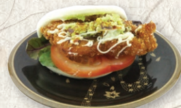
Chicken Steamed Bun Burger