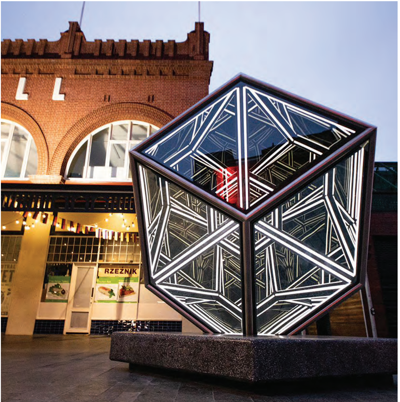
Above: The new Illuminate Adelaide art installation on Grote Street. Created by Jason Sims, Golden Rhombobedron (Obtuse), 2021, stainless steel and LED lighting.