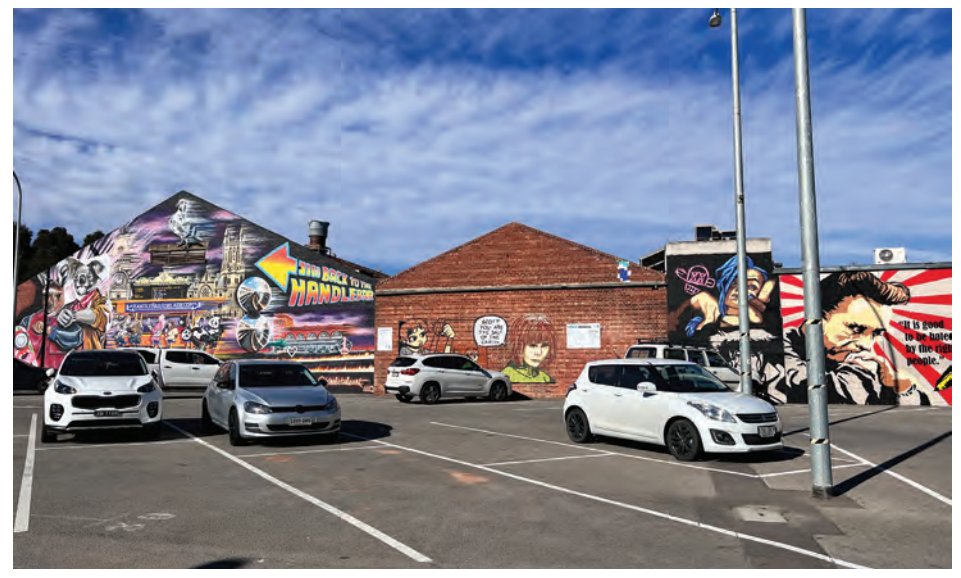
The 'Handle Bar Mural' is by artists Whale Tail Art and was supported by one of AEDA's Citywide Shopfront Improvement Program grants.

If you do head into the Market U-Park, you'll find directional signage has been installed to guide you through the modified parking areas. More short term parking is currently available as long term options such as Early Bird have been suspended.